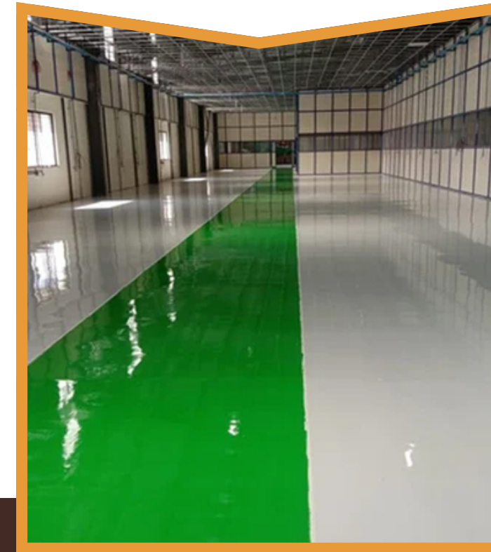
Industrial Paint Surfaces