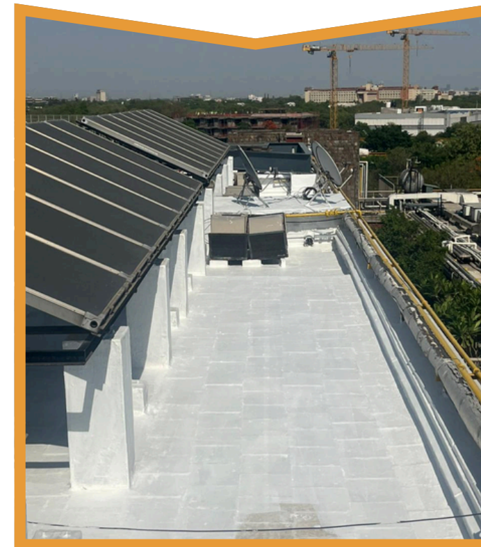
Waterproofing Treatment Zones