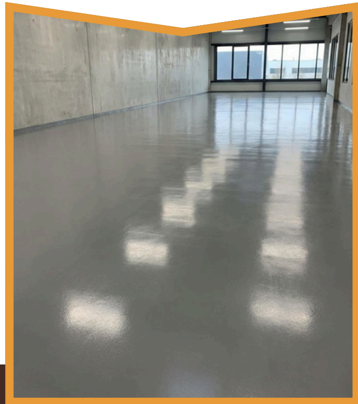
Industrial Flooring Zones

We provide specialized flooring for various sectors, including