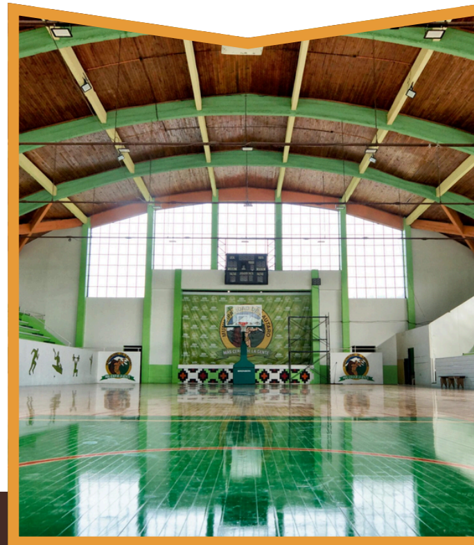
Sports Area Flooring